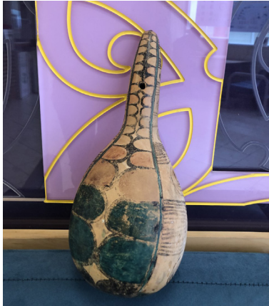
(WHAKAAHUA 4 Te Wānanga Takiura. (2019). Te Hue o Te Wānanga Takiura. Tāmaki Mākaaurau