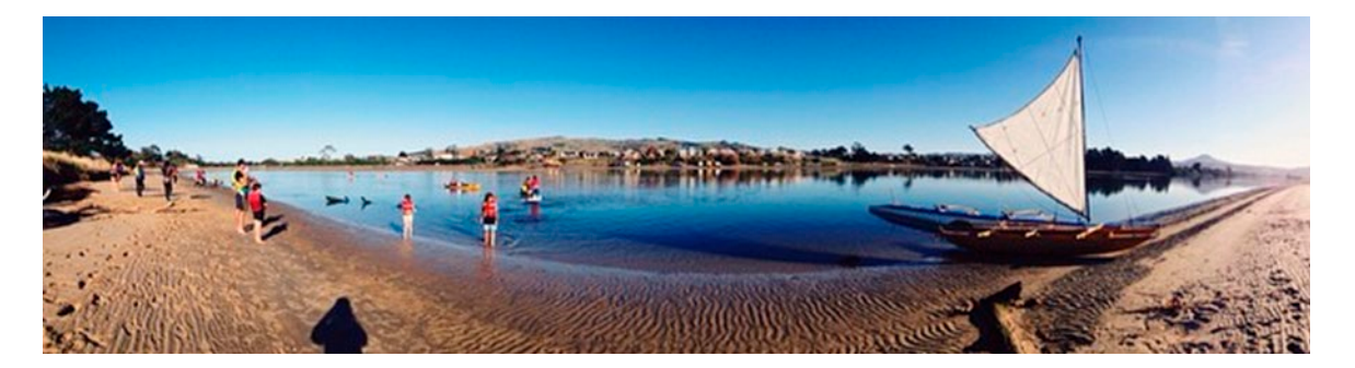
FIGURE 3 Hauteruruku waka pictured on Ohinepouwera adjacent to the Waikouaiti River, Karitāne, June 2015.