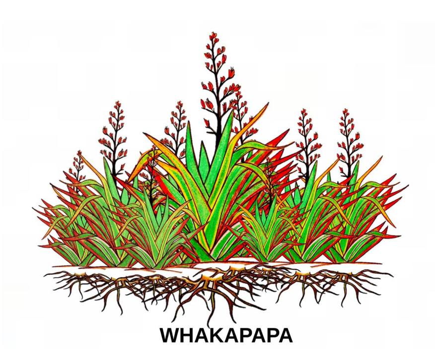
FIGURE 2 Te Pā Harakeke

Building on mātauranga Māori informed practices and ways of being that foreground the treasured status of mokopuna (Jenkins & Mountain Harte, 2011; Pere, 1997; Pihama et al., 2015), Oranga Mokopuna provides a Te Ao Māori frame of reference for the full realisation of mokopuna rights to health and wellbeing (see