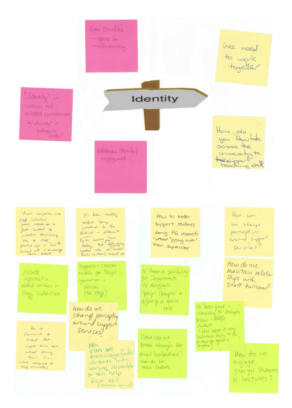
FIGURE 1 Post-it notes from fono participants gathered from faculty-based groups of departmental academic and professional staff

palagi communities, Pacific- and palagi-orientated pedagogies, and amongst themselves. Relatedness overlaps with dialogue, constituting relationships and flowing across relational spaces. While dialogue is to do with the way expression shapes relationships, relationships are more contexts for expression. In an intercultural educational setting, relational methodologies have the potential to facilitate interactions across groups of participants, for instance, teachers and students, catalysing