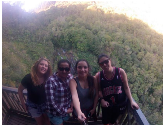
FIGURE 1 Left: Whānau on a hīkoi up Te Mata o Rongokako; right: Whānau on a hīkoi at Tangoio Falls.