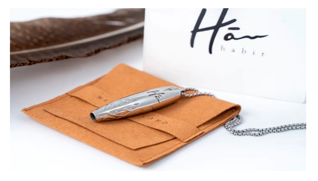
FIGURE 3 The "Classic Silver" version of the Hā tool.

and anxiety" (p. 1). Wikeepa (2022) explains that the design was inspired by the taonga pūoro, specifically the koauau, a traditional Māori musical instrument. Flintoff (2014) states that taonga pūoro are seen as the children of the families of the gods who brought them into being (p. 1). "Rangi" means tunes as well as Father Sky, to whom music drifts up, so melodic instruments are from the world of Rangi. The heartbeats of Papatūānuku are the basis of musical rhythms.